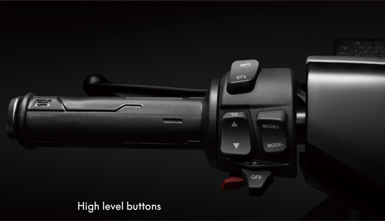
High level buttons