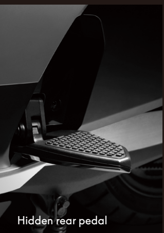
Hidden rear pedal