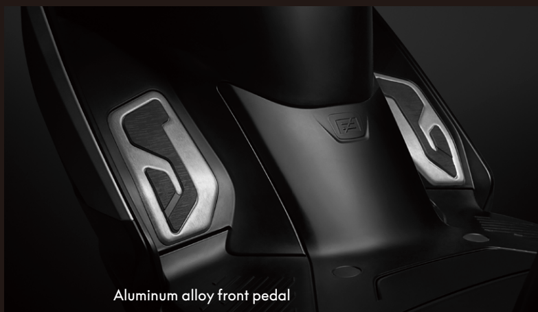
Aluminum alloy front pedal