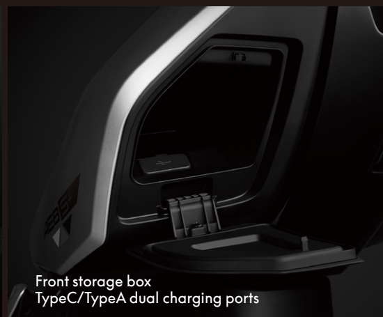
Front storage box TypeC/TypeA dual charging ports