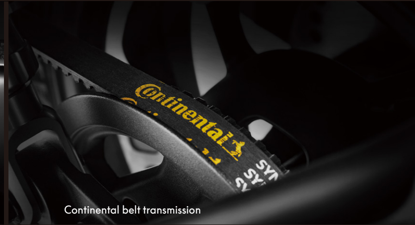
Continental belt transmission